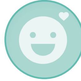
HAPPINESS & ENGAGEMENT

Financial security, healthy living, and happiness and engagement are the three elements for retirement readiness. Integrating all three of these components enhances retirement planning and can provide balance in the golden years.