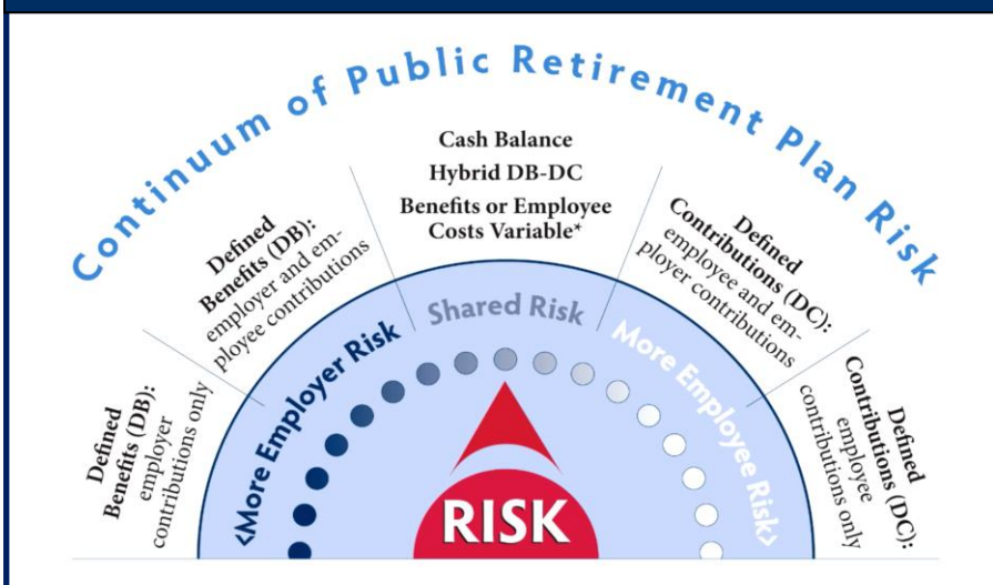
Figure 1: Continuum of Public Retirement Plan Risk

Hybrid plans have been in place in public sector retirement systems for decades, and they have received increased attention in recent years as more states established hybrid plans on either an optional or mandatory basis. The growing attention to hybrids has occurred amid the many adjustments states have made to public pension benefits and financing arrangements. Modifying retirement plan designs can have potential unintended outcomes, as states find that closing their traditional pension