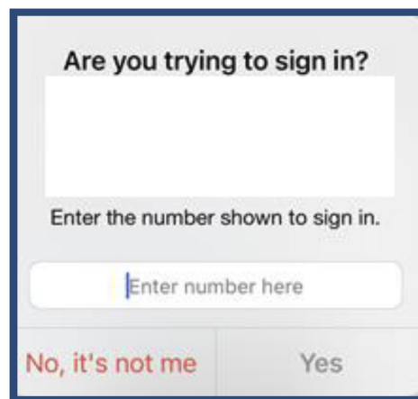
Figure 4: Microsoft Authenticator Number Matching Prompt

The Microsoft Authenticator App has implemented a safeguard to help protect users from this attack. The app requires the user to view both the request screen and challenge screen simultaneously, which prevents hackers from accessing the account. ■