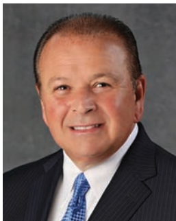
Commissioner Taylor Barras