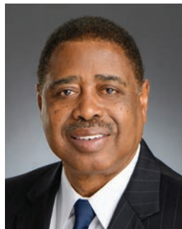
Senator Edward Price