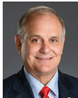
Representative Tony Bacala