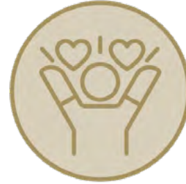
HAPPINESS & ENGAGEMENT

Financial security, healthy living, and happiness and engagement are the three elements for retirement readiness. Integrating all three of these components enhances retirement planning and can provide balance in the golden years.